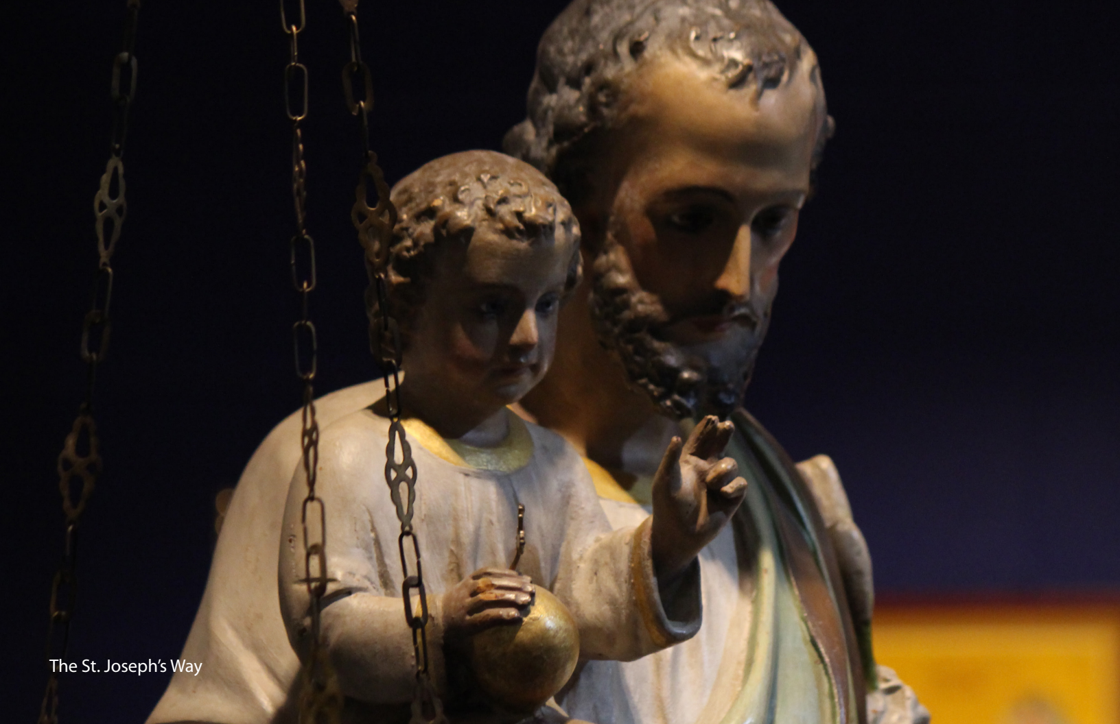
The St. Joseph's Way